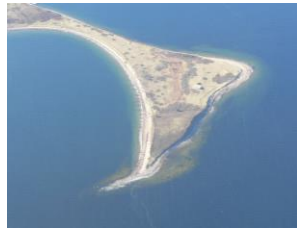
Masons I Northern end