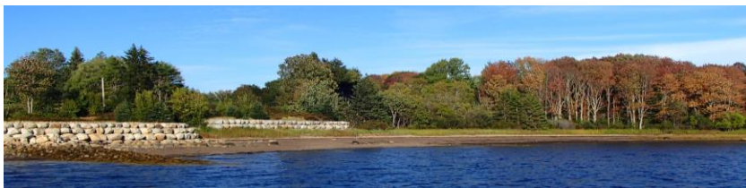
Oakland Conservation Area