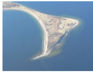
Masons I Northern end