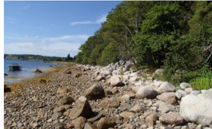
Zwicker Island lot