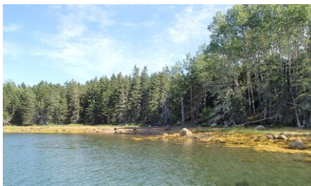
Zwicker Island lot