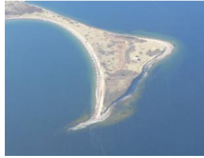
Masons I Northern end