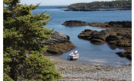
Long, Dry, Centre, Snipe