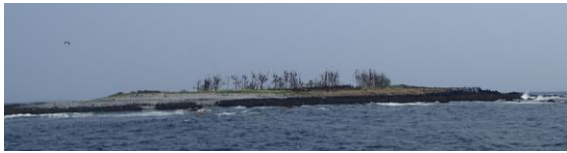
Little Duck Island