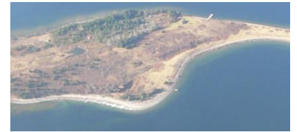
Masons Island (big cove)