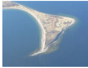
Masons I Northern end