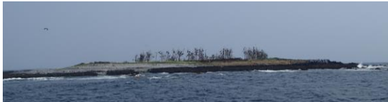
Little Duck Island