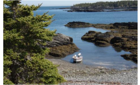
Long, Dry, Centre, Snipe