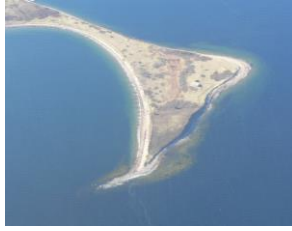
Masons I Northern end