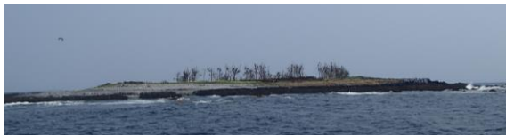
Little Duck Island