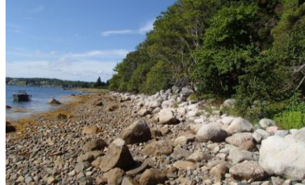
Zwicker Island lot